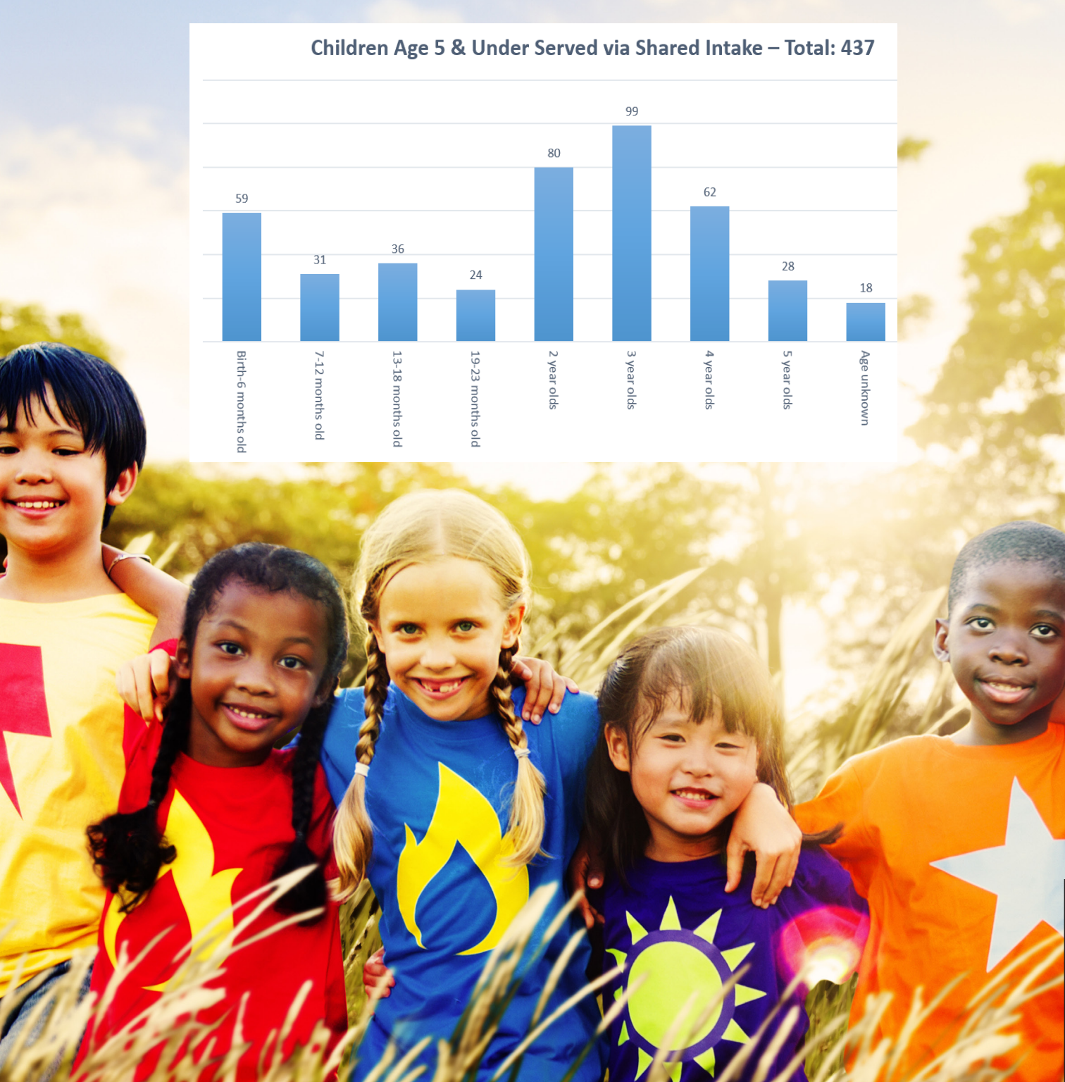
Children Age 5 & Under Served via Shared Intake – Total: 437